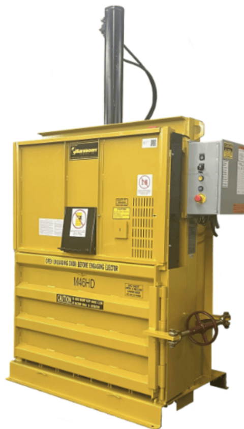
(Shown Without Standard Casters)

The M46HD Vertical Baler is the Ideal Solution For: