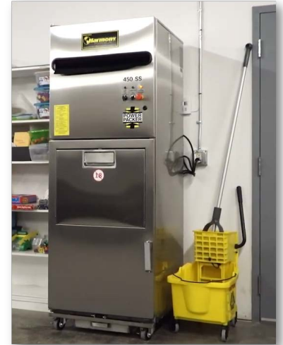
Harmony's SmartPack Automatic Compactor & 450SS Stainless Steel Compactor, Both With Insite Technology