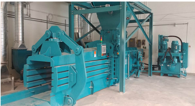
HM-A160 Horizontal Baler