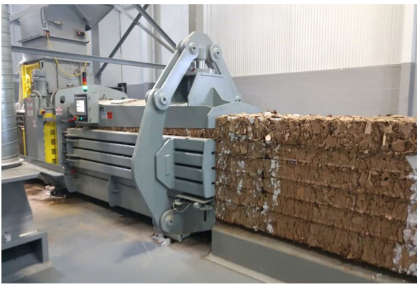
HM-A160 Open End Auto Tie Baler