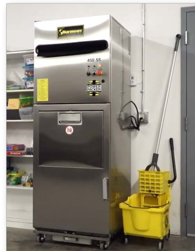
Harmony's SmartPack Automatic Compactor & 450SS Stainless Steel Compactor, Both With Insite Technology