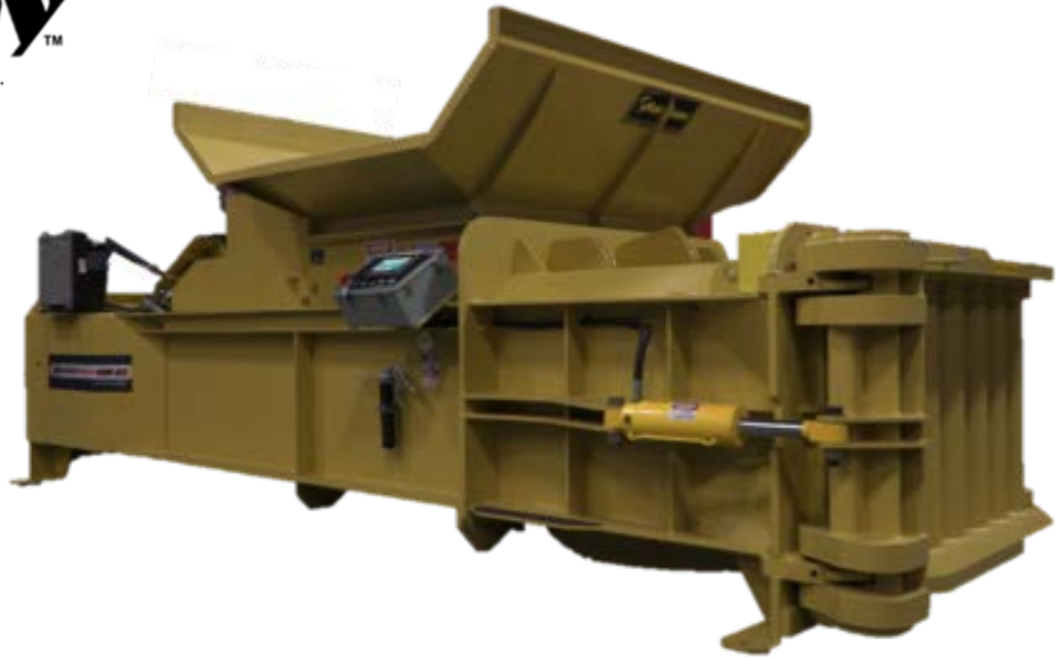
Shown With Ambidextrous Hopper