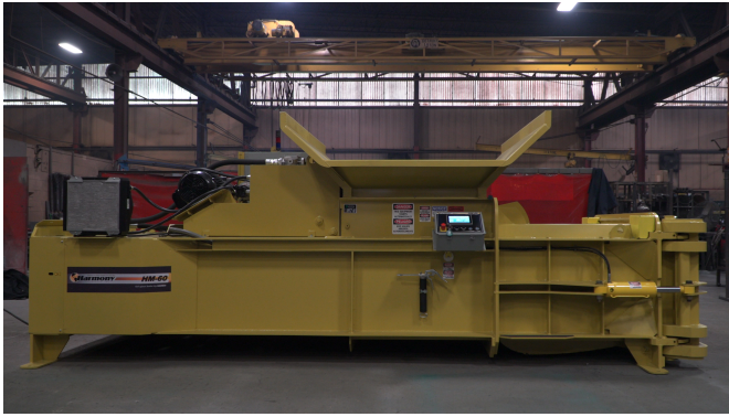
HM-60 Horizontal Baler