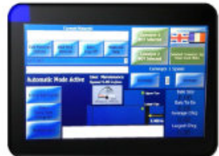
Color Touch Screen Display