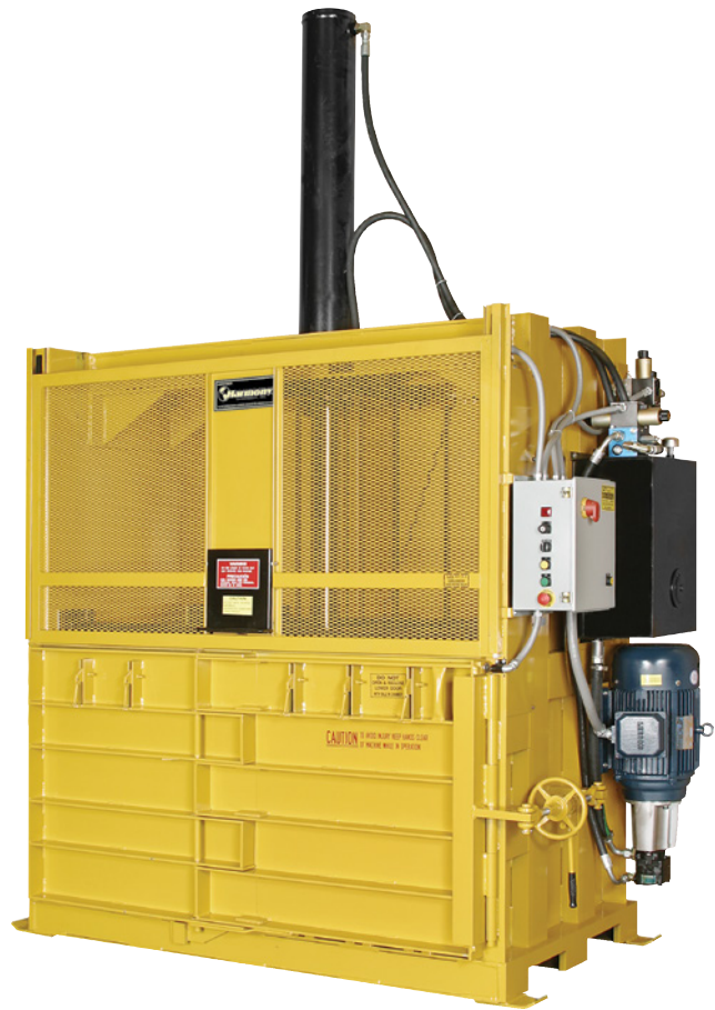
Optional Double Hinged Door Shown