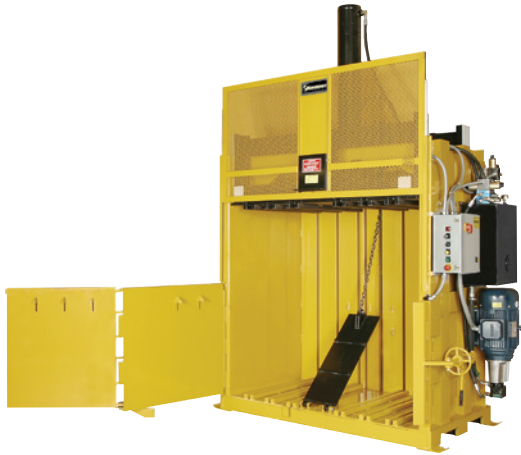
Optional Double Hinged Door Shown