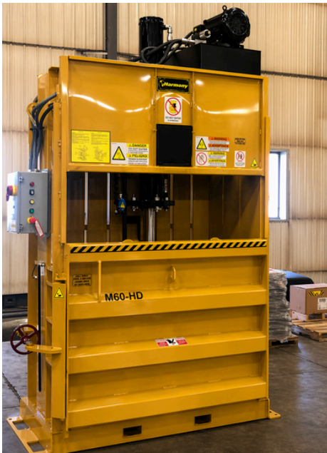
M60HD Vertical Baler