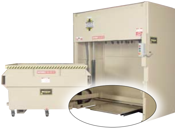
Container Support System