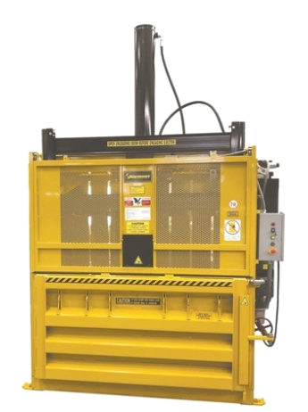
M72HD High Density Baler

Every Harmony vertical baler meets or exceeds all ANSI and OHSA Standards and utilizes the finest hydraulic and electrical components. Recycle your operational by-product into additional revenue today!