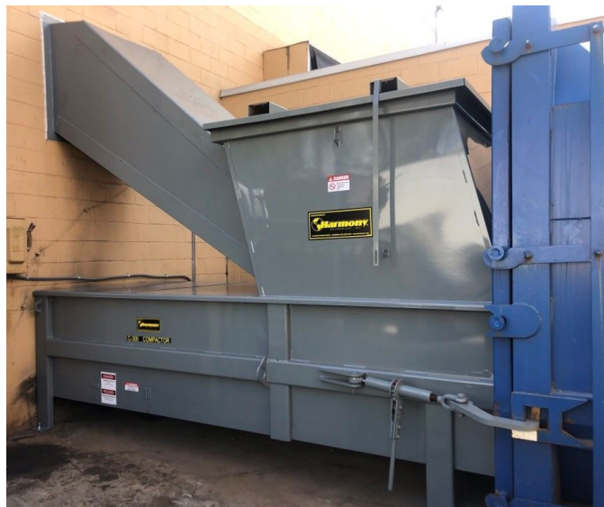
Harmony's C300 Stationary Compactor

©2019 Harmony Enterprises, Inc. All rights reserved.