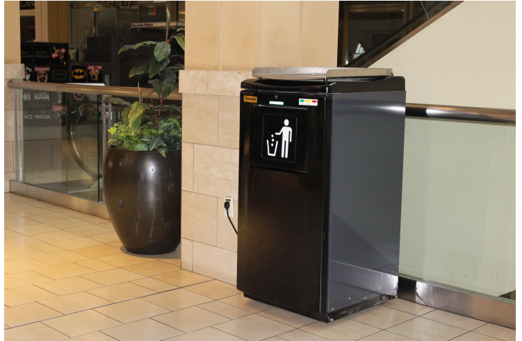
Harmony's SmartPack Automatic Compactor With Insite

©2019 Harmony Enterprises, Inc. All rights reserved.