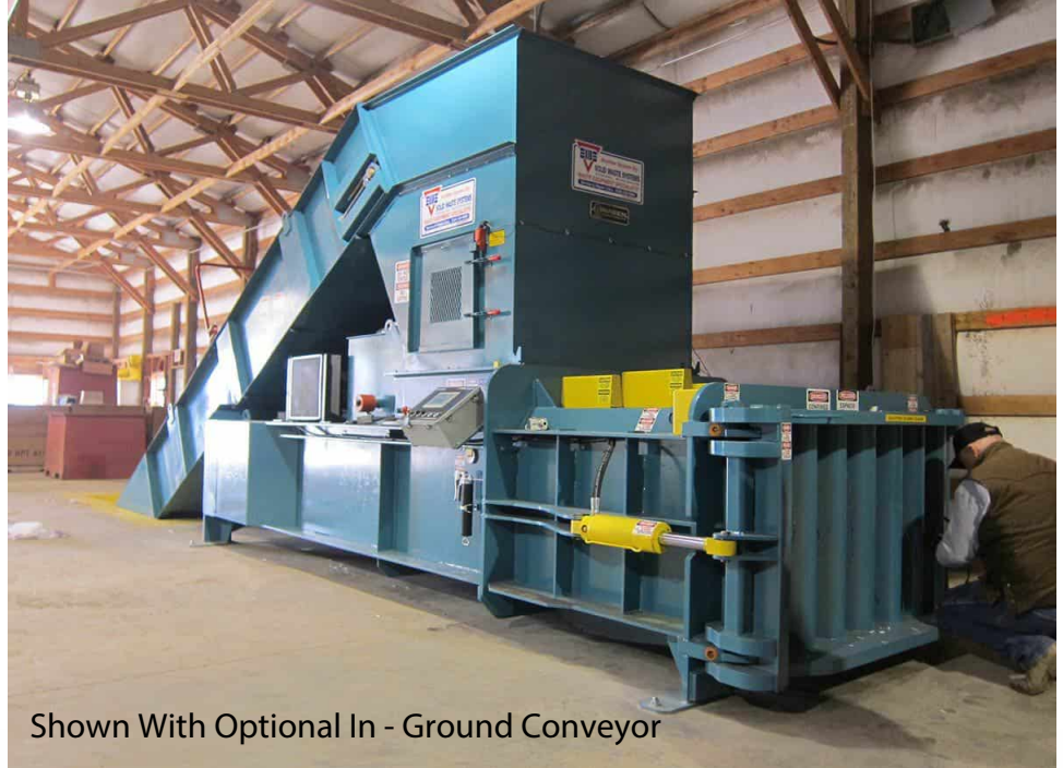
Shown With Optional In - Ground Conveyor

Harmony's HM60 Horizontal Baler is the Ideal Solution For: