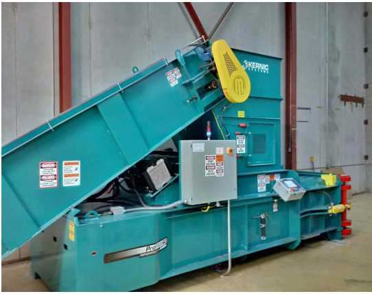
HM60 Horizontal Baler