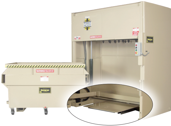
Container Support System