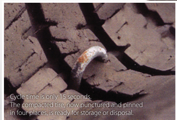
Cycle time is only 15 seconds. The compacted tire, now punctured and pinned in four places, is ready for storage or disposal.